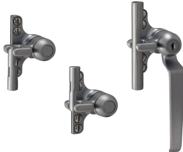
B646NOSE & 2 Connectors